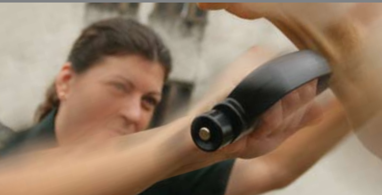
Shown: AutoLock® Defender