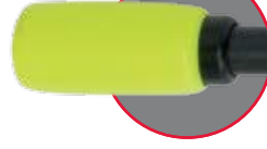
3xT POWER SAFETY TIP